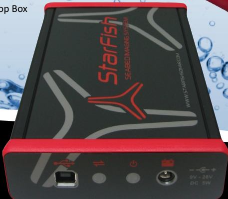
StarFish 990 Electronics Top Box