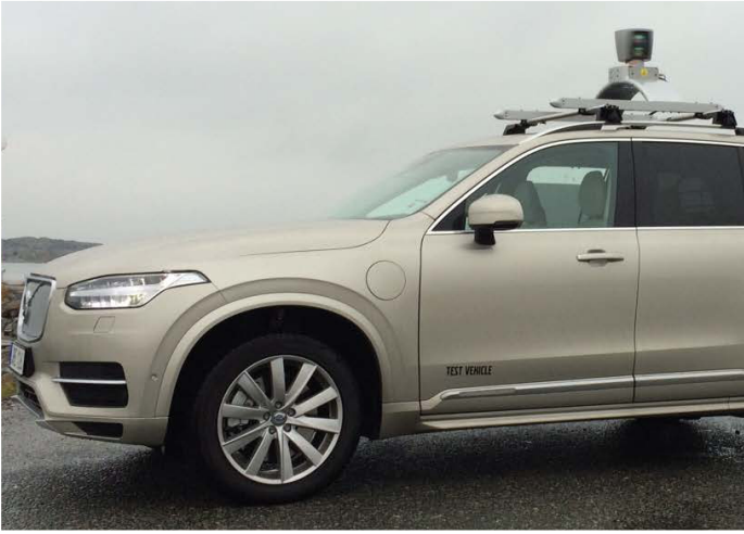
HDL-64E mounted atop Volvo CX-90 self-driving research vehicle. 360° sensor rotates up to 15 Hz.

The HDL-64E S3 provides high definition 3 dimensional information about the surrounding environment.